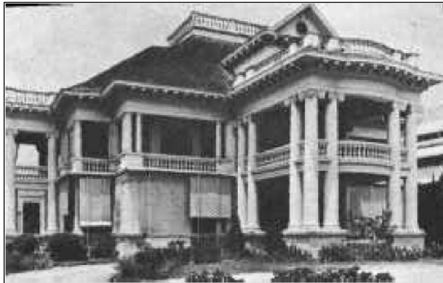
Figure 7: Bok House built in 1920 - along Ampang Road, that we know better today as Le Coq d'Or;