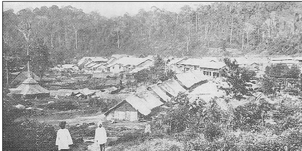
Figure 4: Kuala Lumpur in transition (c 1884) – attap shanties in the foreground and brick buildings behind with the “wall of jungle” in the background; Source: Gullick, J. M., (2000), A History of Kuala Lumpur 1856 – 1939 , Selangor: MBRAS, p. 312

In 1870 until 1873, this trading place was a frontier town beleaguered by the Selangor Civil War. In Gullick's (1994) statement during this time, Kapitan Cina Yap Ah Loy became a leader. He was responsible for the survival and growth of the town. In 1880, the Selangor state capital was moved from Klang to