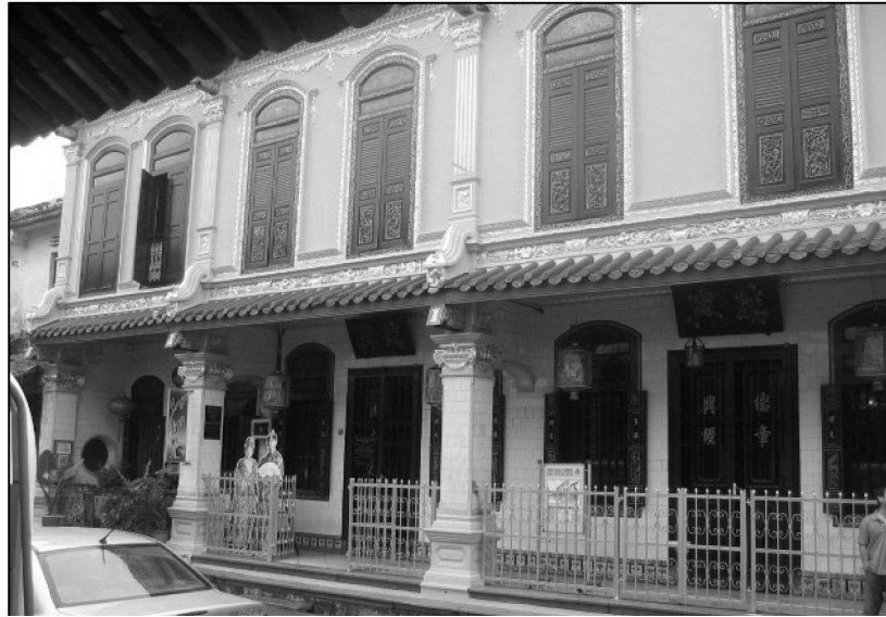
Figure 3: Town houses that built after mid 18 th century that have been converted into museums

and formal. The principal design is mutual symmetry along a single alignment from north to south. This had automatically made the Chinese buildings design had a typical shape, either a rectangle or a square. In town areas, houses were built and planned by taking materials, interior space and street frontage into