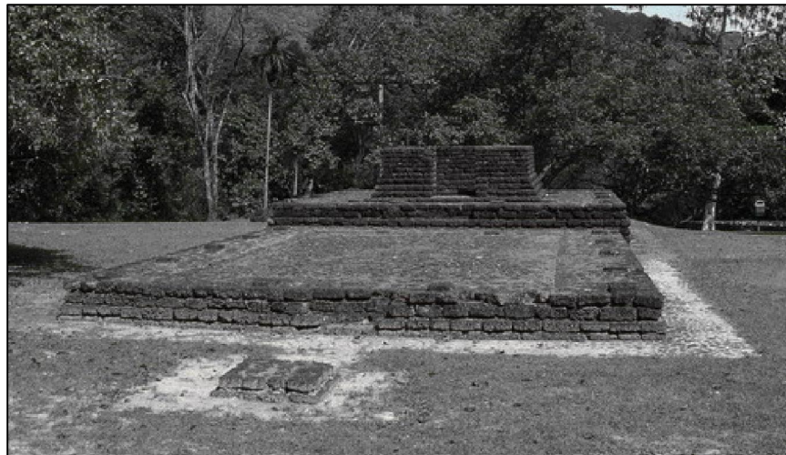
Figure 1: The reconstruction of the candi found at the premise of the Lembah Bujang Museum.

The development of architectural styles in Malaysia is one of the greatest storyline of the local architectural history. During the 5th century AD, traders from India and China used the East-West trade route and would stop at Tanjung Dawai as a stopping point. The traders traveling with the ships/junks between China and India used this place as an ideal resting destination while waiting for the monsoons to change. They, at the same time, spread their religion and culture when they settled down for trades. This can be seen during early Hindu-Buddhist civilisation in Lembah Bujang, Tanjung Dawai, Kedah. They had left their marks in a form of tomb temples known as candi at Lembah Bujang (Bujang Valley). After centuries, Kedah became a vassal of the Sumatran kingdom of Sri Vijaya. Yeang (1987) had stated that the beginning of the Indian Kingdoms styles can be traced in the early architecture of Sri Vijaya and Majapahit Empires, which is from the 7 th to the 14 th centuries. Eventually, Malacca was established as an important port (Straits of Malacca), where it became a major trading centre for shipping route between China and India. The traders brought along their cultures and customs, which had influence the existing local's culture.