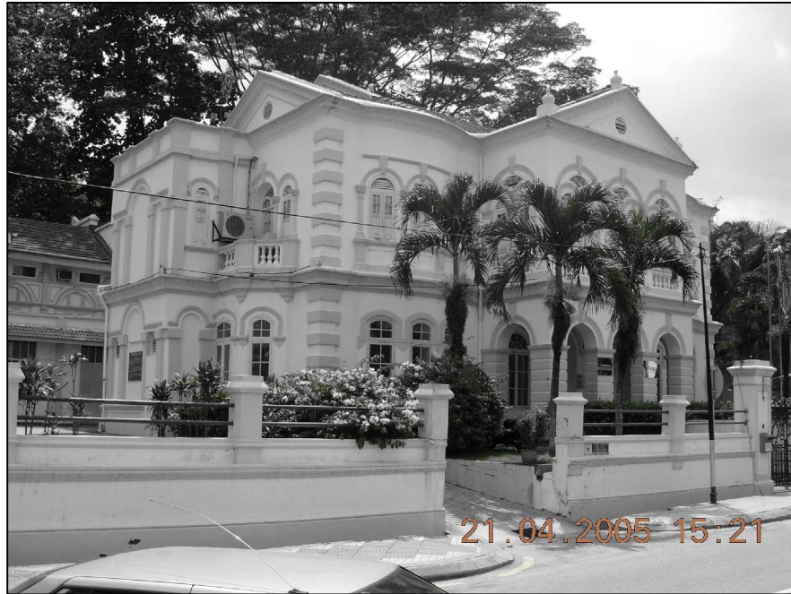
Figure 8: Wisma Loke stands on the site of an earlier mansion which was erected by a wealthy tin miner, Chow Ah Loke in 1885.

ii. Chinese/European influence - These buildings have various styles from both Chinese and European influences. Another example on this style is Wisma Loke, which was built by a wealthy tin miner's family during 1885. The mansion is reminiscent of a European-style villa and had a symmetrical design with a central entrance doorway leading to an inner two-storey courtyard. As